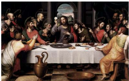
“The Last Supper”, by Juan de Juanes (ca. 1523-1579), Museo del Prado, Madrid.

Maudy Thursday service tonight, 7:30 p.m.